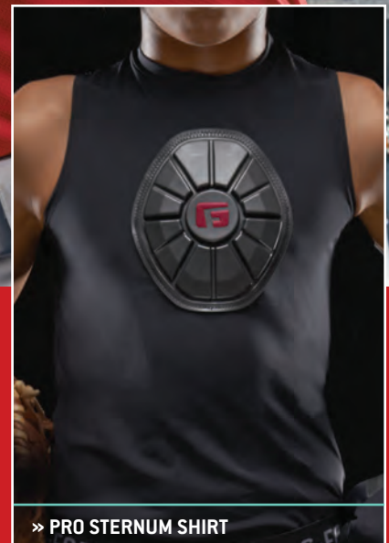
» PRO STERNUM SHIRT