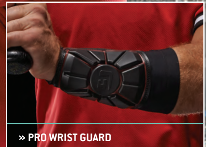
» PRO WRIST GUARD

RPT ™ With proprietary RPT technology, G-Form guards are soft and flexible and only harden on impact. Learn more at g-form.com