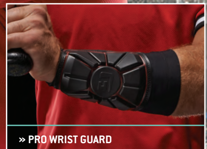
» PRO WRIST GUARD

With proprietary RPT technology, G-Form guards are soft and flexible and only harden on impact. Learn more at g-form.com