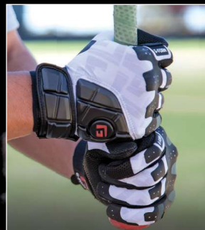
» PRO BATTERS GLOVES

»LIGHTWEIGHT »FLEXIBLE »LOW-PROFILE »WASHABLE