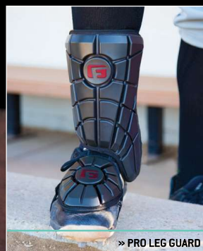
» PRO LEG GUARD

»LIGHTWEIGHT »FLEXIBLE »LOW-PROFILE »WASHABLE