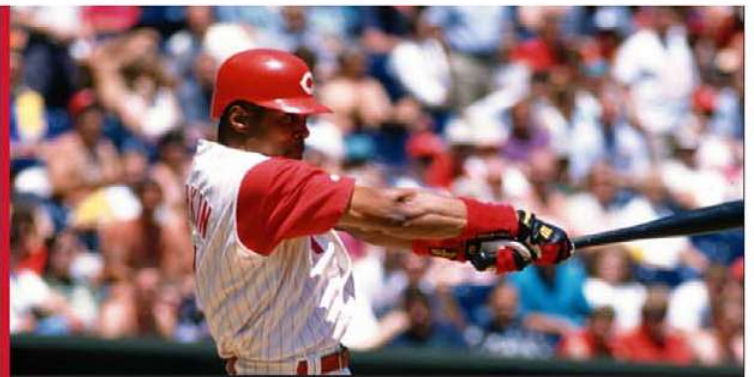
BARRY LARKIN • MLB HALL OF FAME